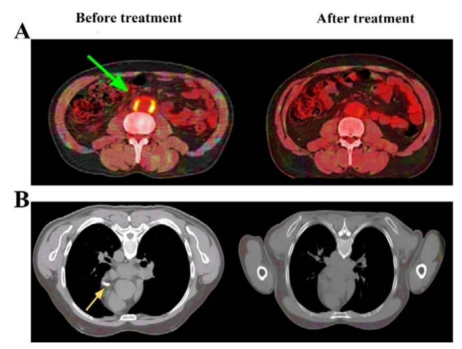
Fig2. Aortitis in the thorax as shown on contrast-enhanced CT prior to and following steroid treatment. A) Thoracic especially in comparison CT imaging showed thickness of the vessel walls at the region of the aortic arch and aortic arch, left anterior artery, and left descending aorta artery prior to steroid medication. B) The swelling of the aorta wall has totally vanished after steroid medication.

RF was positive in 20/23 patients, and rheumatoid lesions were discovered in 11/21 instances. In the individuals diagnosed whose doses were disclosed, the average oral steroid dosage for aortitis was 49.1 mg/ day PSL. Two patients received intravenous steroids in addition. One individual had a single round of steroid